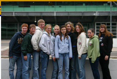
Members at the Indy Speedway