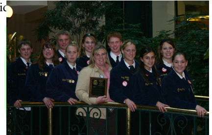
Members at Nationals with 3 Star Chapter Plaque

Our chapter is currently working hard to develop another Program of Activities that would be able to meet the needs of our chapter members to excel in the coming year of FFA.